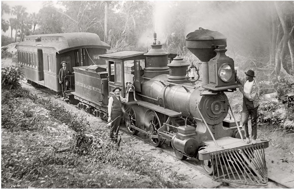
The Jupiter and Lake Worth Railroad, c. 1890